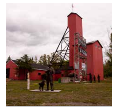
20 | Timiskaming District CSWB Plan